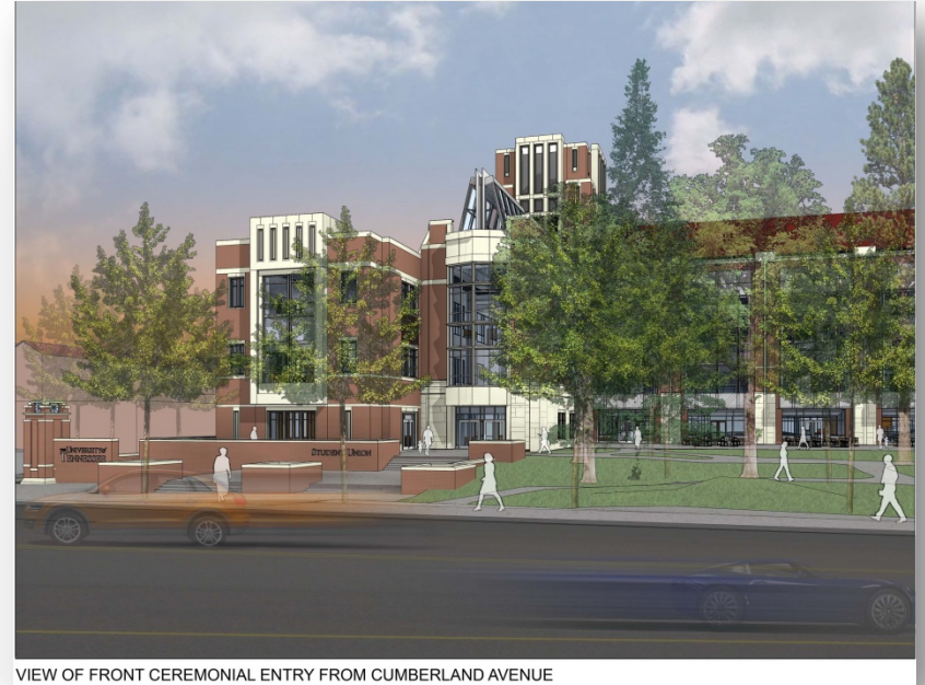
VIEW OF FRONT CEREMONIAL ENTRY FROM CUMBERLAND AVENUE